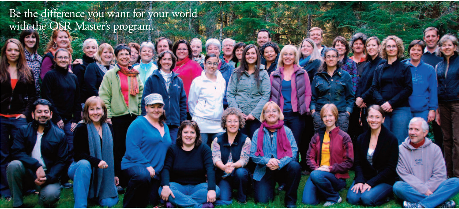
Did you ever think grad school could look like this? The 17th cohort begins their learning journey together near Port Orchard, Washington.

Be the difference you want for your world with the OSR Master's program.