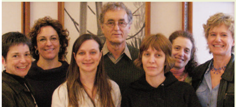
Living systems theorist and author Fritjof Capra with systems design team.

> Three- to five-page double-spaced, typed essay to help determine the fit between your goals and the capabilities of the program. For details, go to http://osr-nw.org/apply/